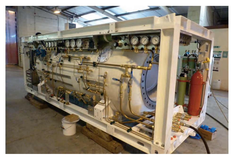
Figure 3 : TUP Shuttle at factory test

The approvals/exemptions/variances/ procedure is likely to make considerable demands for documentation to be produced. Clients should therefore be careful not to place additional demands on contractors to produce unnecessary documentation at any stage of the HPCA work.