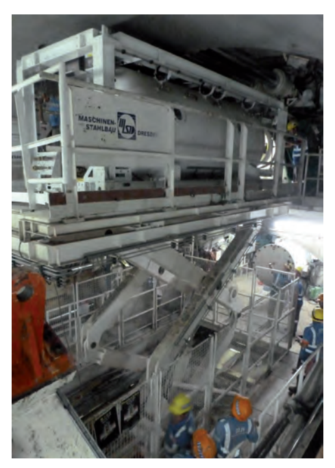
Figure 2 : TUP shuttle being mated to TBM lock