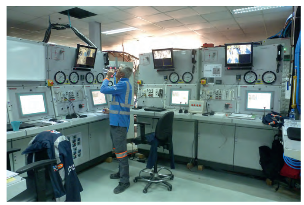
Figure 4 : Habitat control panel